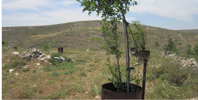
The Settlement Division Exposed